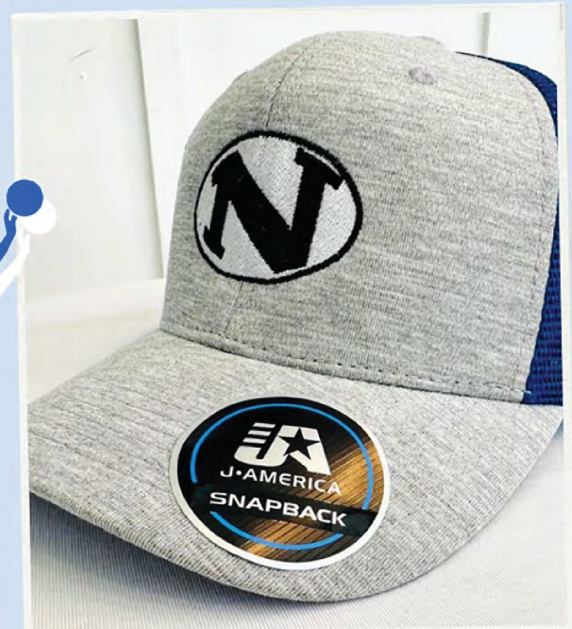
CAPS + HATS