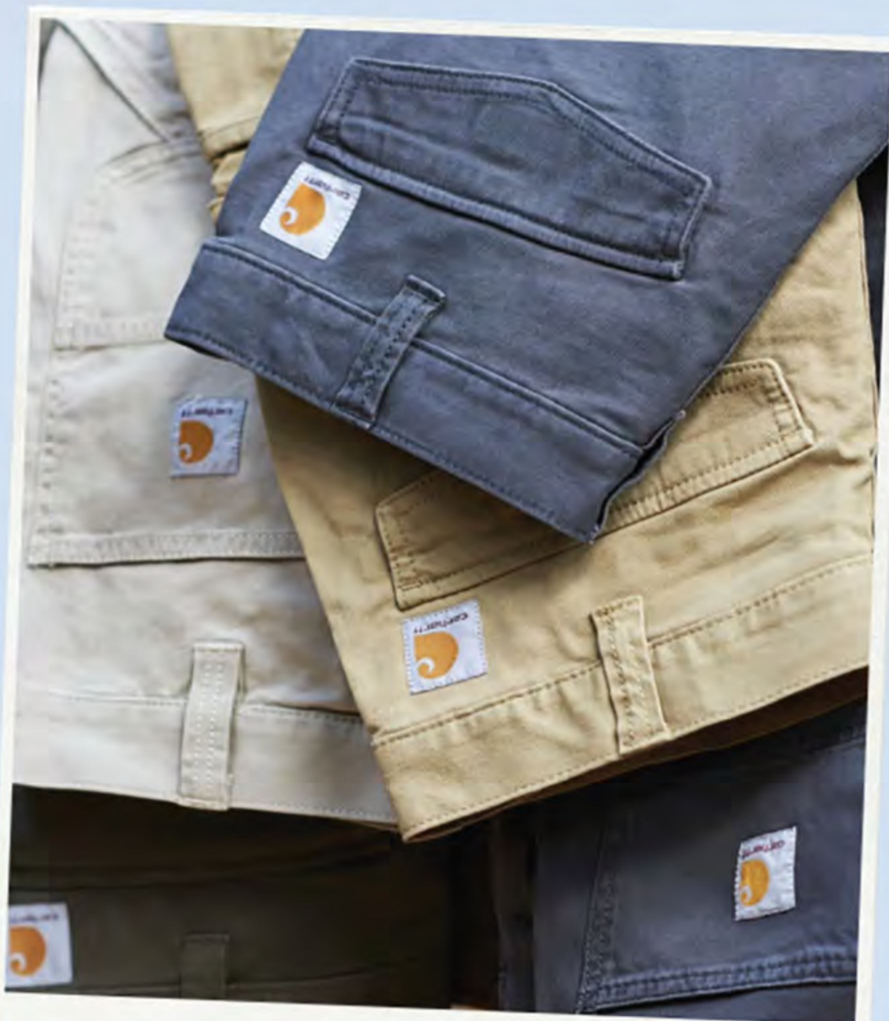
JEANS + PANTS